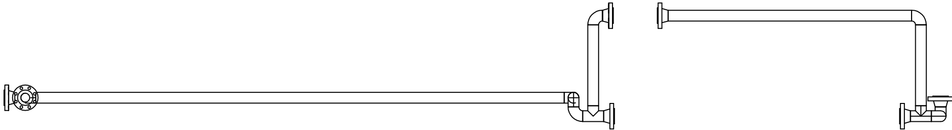
OIL ELEVATION VIEW SCALE = 1: 20